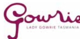
Lady Gowrie Tasmania