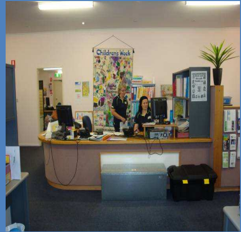
Inclusion Support Facilitators