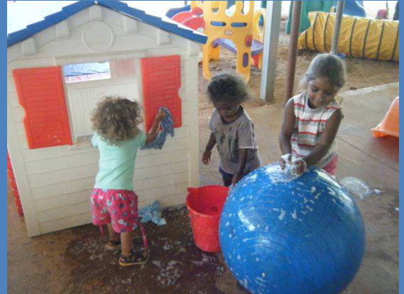
Keeping equipment clean