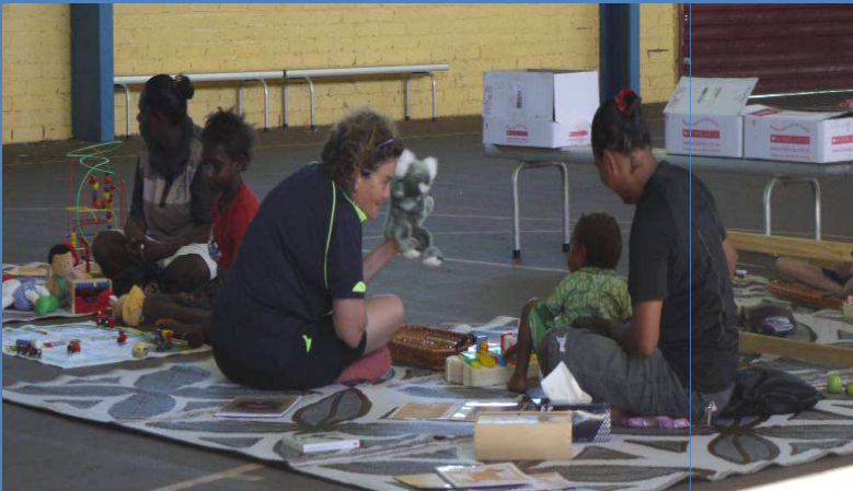
Working in remote communities