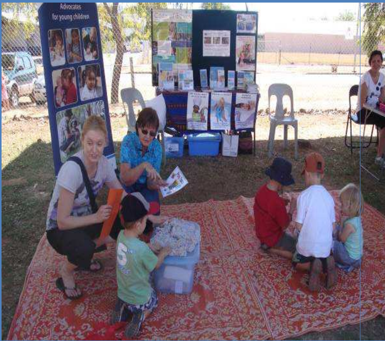
Teddy Bears Picnic