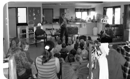
Withcott Early Learning Centre