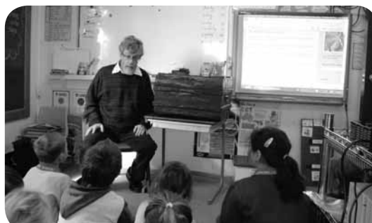
Making good use of magic whiteboards at the Ma Ma Creek State School telling the story from Tenthill Lower School, Tent Hill Lower Cliff Rescue and showing it on the blog.