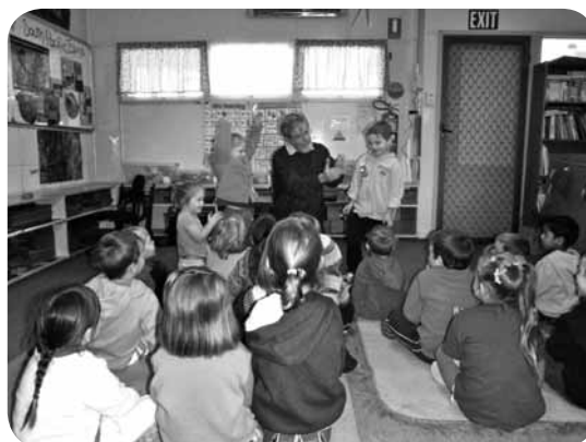
Gatton Kindergarten Show