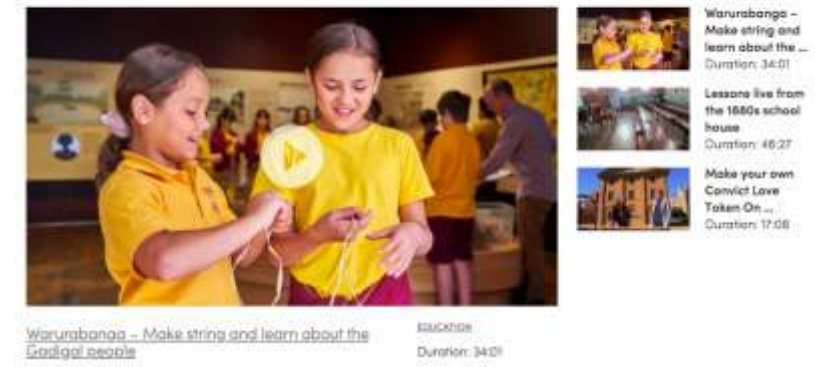
Sydney Living Museums

Did you miss these live event virtual excursions? Watch them again!