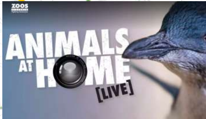
Zoo at home