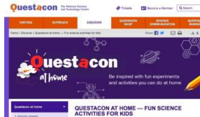
Questacon at home

Did you miss these live event virtual excursions? Watch them again!