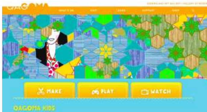
Queensland art gallery