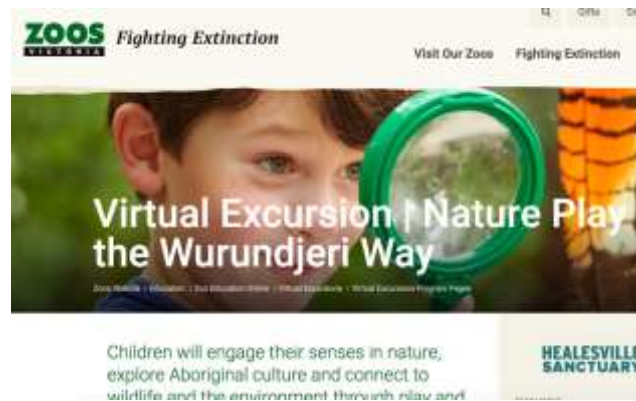
Melbourne zoo virtual excursion for Early Childhood